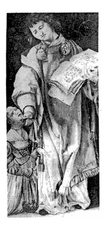
Illustration 1-Girl Being Exorcised. In the context of the Huguenot Wars, Jeanne's exorcists aimed to justify the rituals of Catholicism by proving them efficacious against her multiple severe symptoms.

These historical materials suggest that core features of DID represent a stable diagnostic cluster through time.