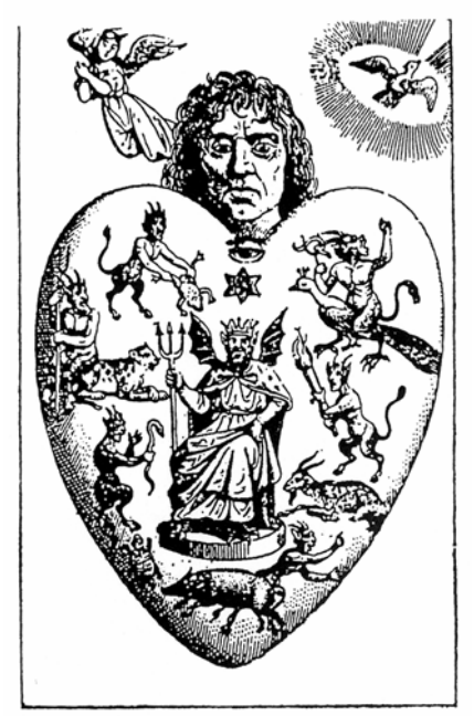
Illustration 2-Satan and Seven Devils.

called and gives her medicine but this does not help because she does not have a physical illness.